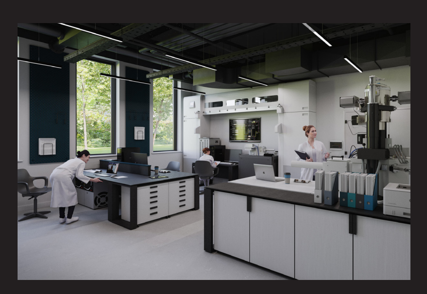
Please note: The images shown above are for illustrative purposes only. Tenants are responsible for providing their own furniture and equipment at their own expense. The Biosafety Level 1 Laboratory Units include access to water supply and foul water drainage. Please contact the Council for further details.